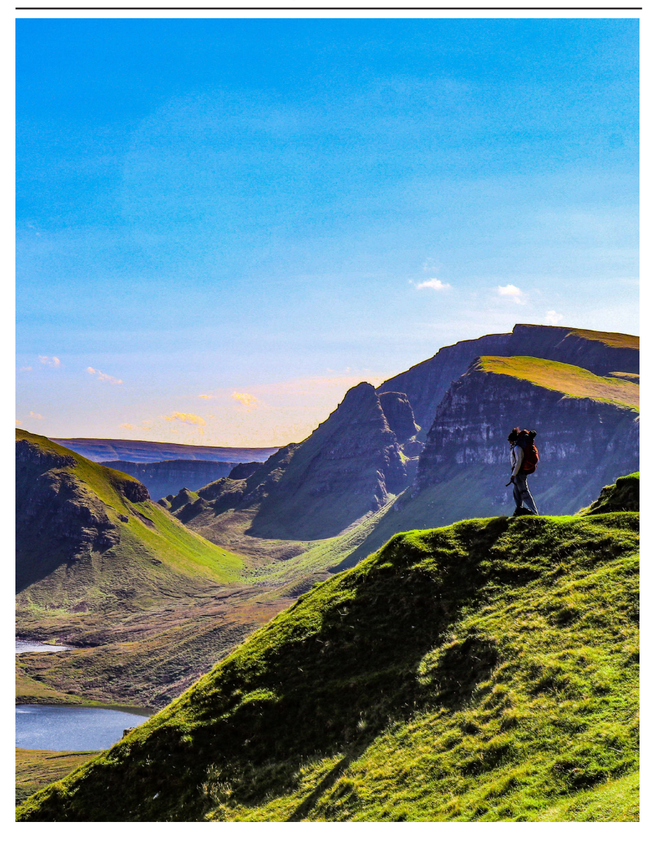
Volume 23, Issue 4

The Monthly Journal of Northern Michigan Mensa