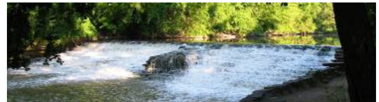
Henry Ford's dam on his Fair Lane estate in Dearborn. This is near the Hyatt hotel, and was used to power an electrical generator in the 1920s.