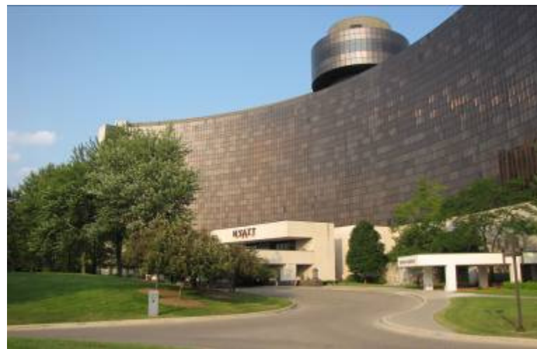
The Hyatt Regency Dearborn, home of AG 2010