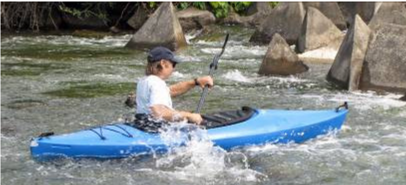
White Water Kayaking below the Sabin Dam near the Boardman River Nature Center at the 2009 NMM Picnic.