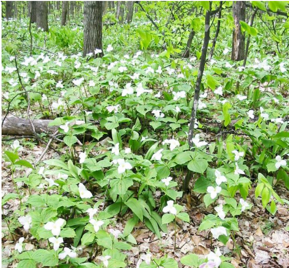
May Trillium on display on the Pete's Woods trail in the Arcadia Dunes C. S. Mott Nature Preserve.

away along with most of the people. We will meet in the parking lot near the Resurrection Life Church on the road between Home Depot and Wall-Mart in the Grand Traverse Crossings Mall near trailhead marker #9. There is a choice of several loop trails so we will decide when we get there. The trails are easy to moderate with some hills involved but no steps. See you there! Call Stan Cain at 231 938 1506 if any questions.